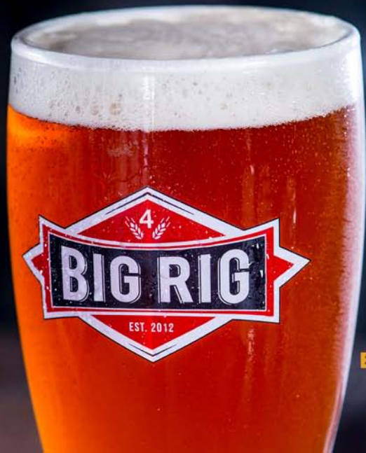
BIG RIG RED